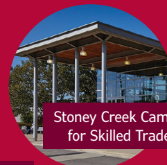
Stoney Creek Campus for Skilled Trades