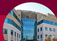
Institute of Applied Health Sciences at McMaster